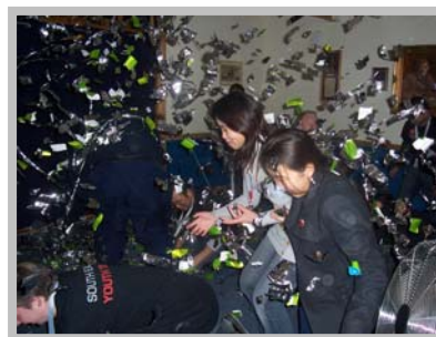
The Crystal Dome & AIDS posters

Eight young people have just returned from the territory Youth Conference – a showcase of work from around the SE including dance for life, life live it and peer education from our area. The Saturday evening was a massive (biggest ever) Crystal Maze followed by a discussion about the new UK strategy on the Sunday.